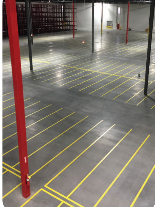
Professional warehouse line striping ensures that space for bulk inventory is maximized in an efficient and effective manner.

Interested in learning more about ID Label's Floor Striping product line? Contact us today for details and free samples.