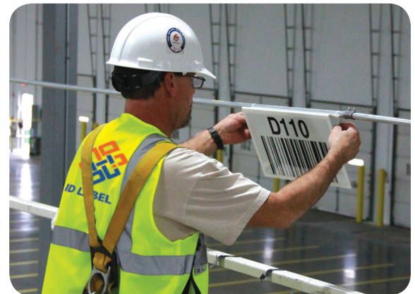
ID Label expertly installs millions of labels and signs each year. Our employees are the most experienced in the industry.

Safely and securely installing overhead bulk storage warehouse signs, aisle markers, dock signs and hanging zone markers—to name a few—requires expertise, knowledge and specialized equipment.