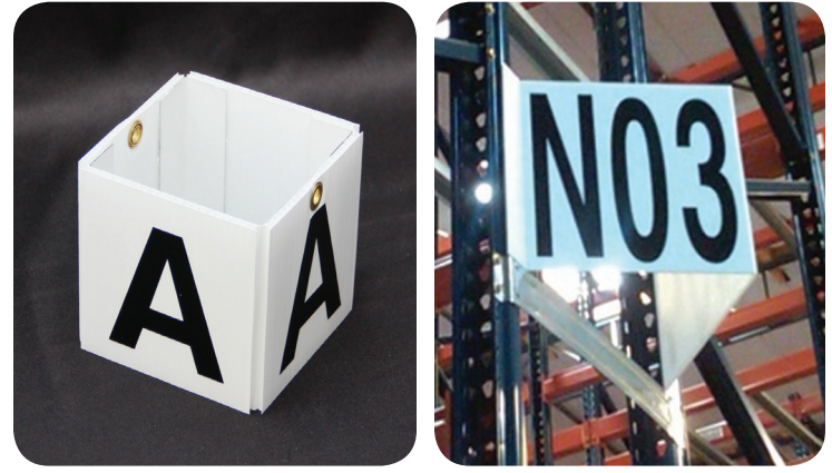
Warehouse signs can be manufactured using a variety of designs and materials, including bent PVC (top), cube (left), and teepee (right)